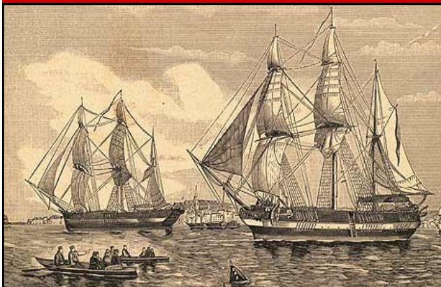
Erebus and Terror leaving England for the Arctic

Museum of Ontario Archaeology, 1600 Attawandaron Rd., London N6G 3M6