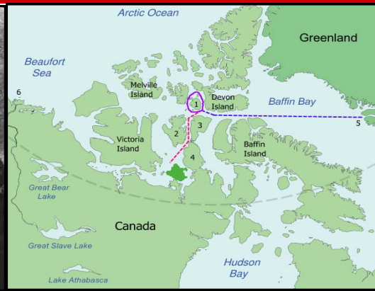
Map of Franklin's fateful route 1845-47